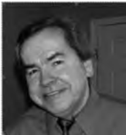
Square Dance Caller